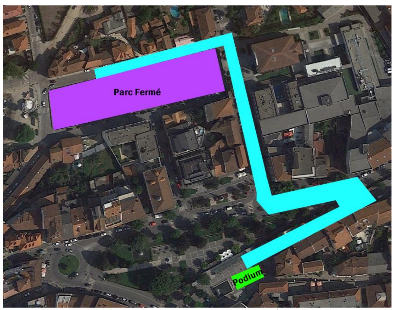
Figure 1 – Path between Podium and Parc Fermé

After the Podium ceremony, cars should be placed on Parc Fermé according to the indications of the organization. Cars can be driven from the podium to the Parc Fermé by a member of the assistance team.