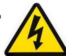
Drawing 5.14 - Minimum size 75mm x 75mm

For vehicles other than racing cars that are not fitted with enveloping bodywork any side exhaust may not extend beyond the plane through the outside of the front and rear tyres with the front wheels in the straight ahead position. Cars of Periods A to E and Drag race vehicle are exempt from these requirements.