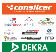
Sticker n.º 5 (50x52cms)